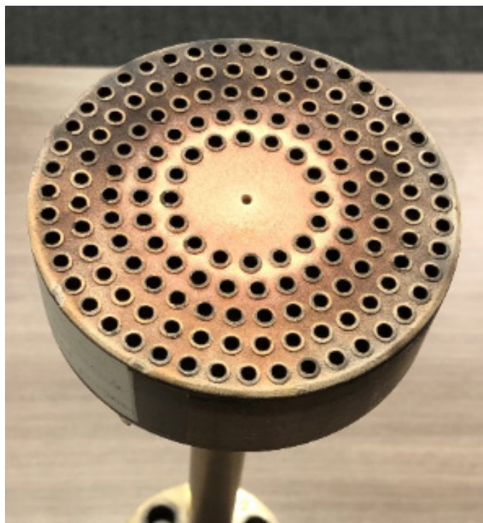
Figure 3. GE/DOE Micromixer

Multiple gas turbine OEMs are working on new gas combustion technologies like micromixers and axial fuel staging, as detailed in Table 2. While the industry is beginning to put these high-hydrogen enabling components to use, primarily to increase efficiency and reduce NO x /CO emissions associated with natural gas-fired power generation, more work is needed to build upon these technologies to accommodate the full range of H 2 -containing fuels, and to demonstrate these innovations at utility scale (see Box 3). Notably, EUTurbines, an association of European turbine manufacturers that includes the four OEMs listed in the table as well as other major vendors, is committed to making gas turbines capable of operating with 100% H 2 commercially available by 2030. 15