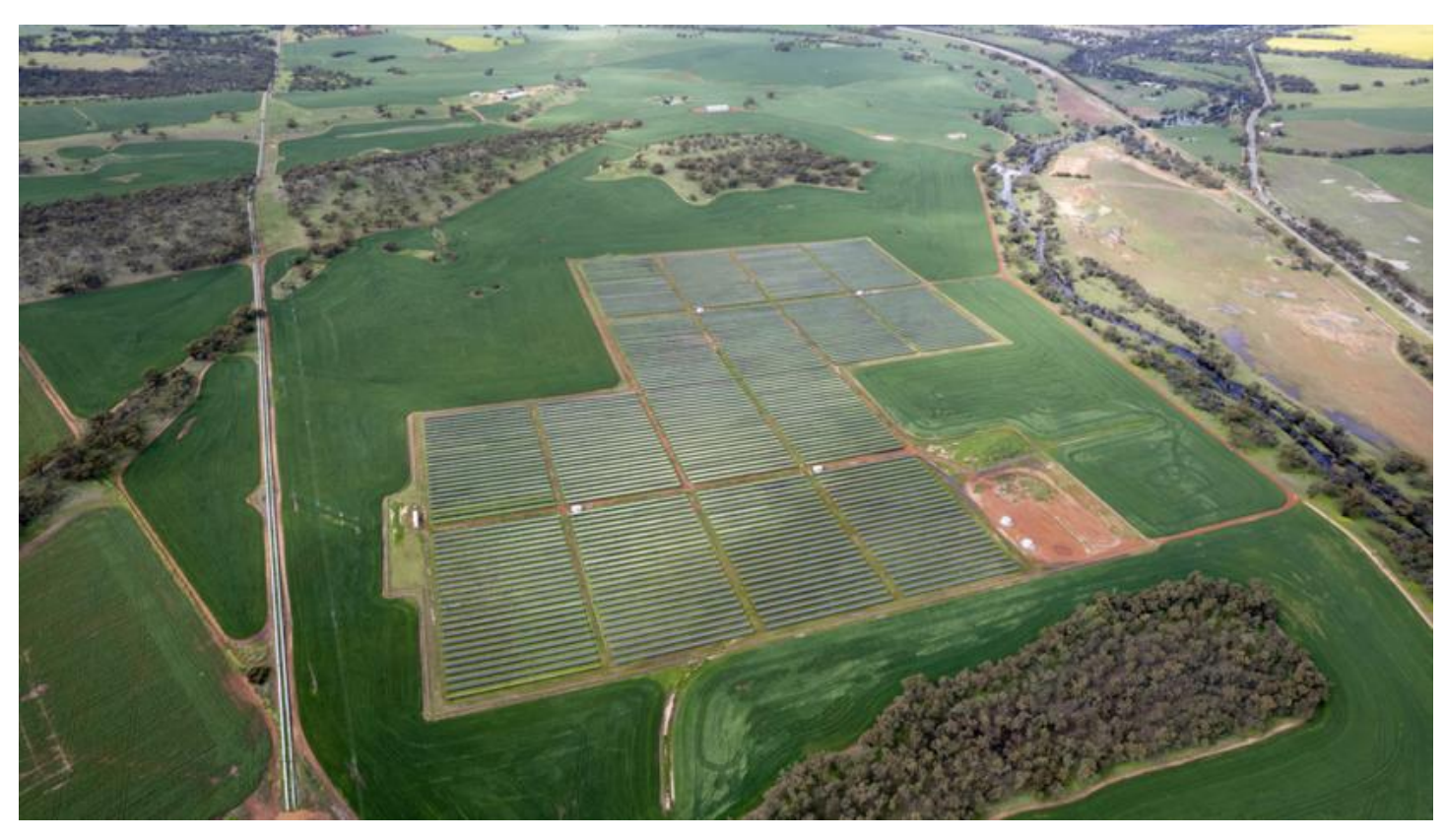
The IGE Northam solar farm which will be the site of the MEG HP1 hydrogen project.

Infinite Green Energy has partnered with WA fuel distributor Refuel Australia, moving a step closer towards delivering the State's first commercial-scale renewable hydrogen.